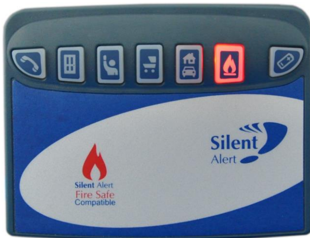
Actual size when printed